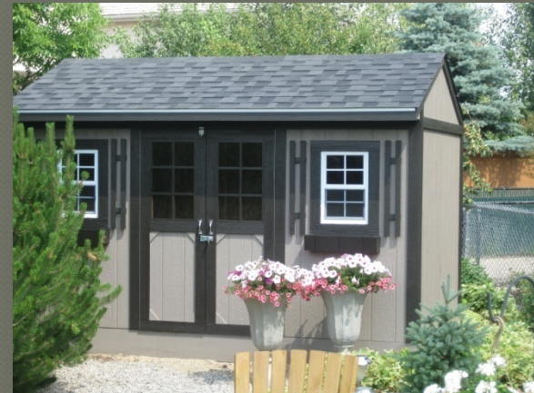
Skirting on Level Surface