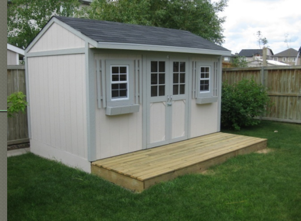
Skirting to Conceal Block Levelling